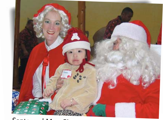
Santa and Mrs. Claus with a little helper.

Approximately 200 patients, families and friends attended the thalassemia annual holiday party on December 19th. The party was held in "The Jungle," which was set up in Children's Hospital's Outpatient Center. Everyone enjoyed an international buffet lunch, games provided by the Lafayette Girl Scouts, facepainting, Tahitian dancers and, of course, a special visit from Santa and Mrs. Claus. A good time was had by all.