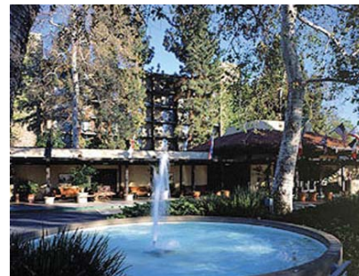
Beverly Garland Hotel