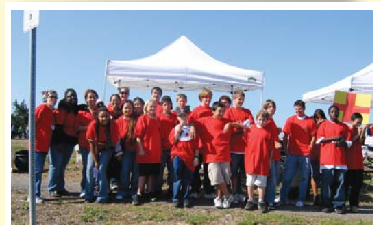
Hardworking volunteers: Our lifesavers!