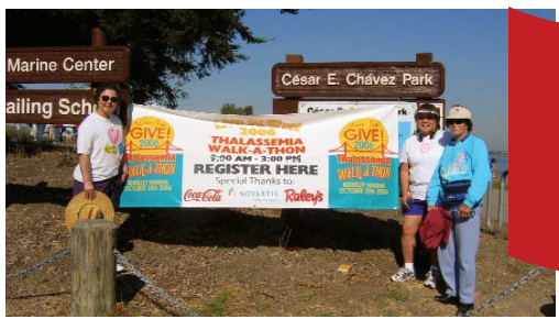
Proud walkers in support of thalassemia.