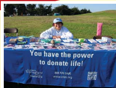
Health fair vendors helping the community.