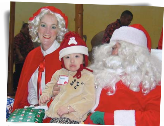
Santa and Mrs. Claus with a little helper.

Approximately 200 patients, families and friends attended the thalassemia annual holiday party on December 19th. The party was held in "The Jungle," which was set up in Children's Hospital's Outpatient Center. Everyone enjoyed an international buffet lunch, games provided by the Lafayette Girl Scouts, facepainting, Tahitian dancers and, of course, a special visit from Santa and Mrs. Claus. A good time was had by all.