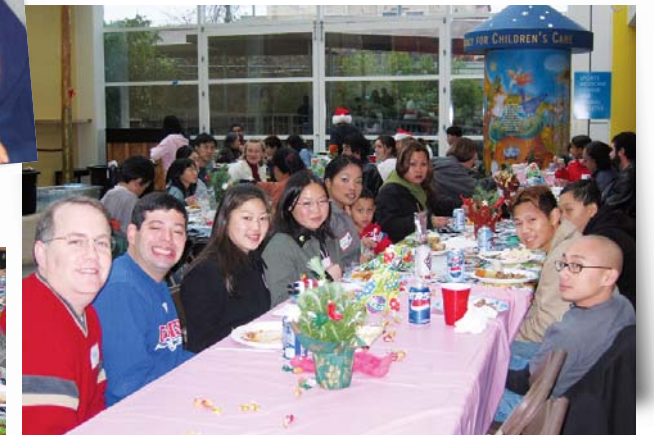
Party-goers enjoy an international buffet.

We would like to sincerely thank our sponsors and donors who have made this party possible: